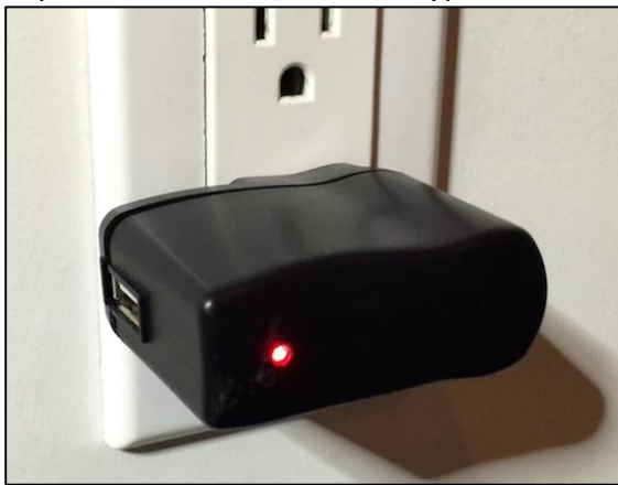
The KeySweeper device in use.